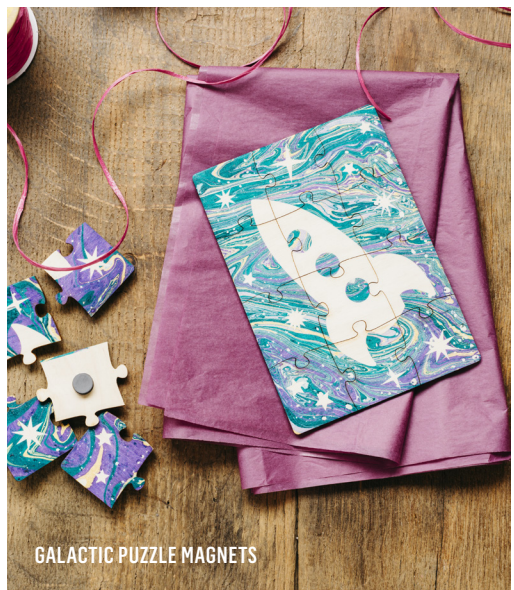
GALACTIC PUZZLE MAGNETS