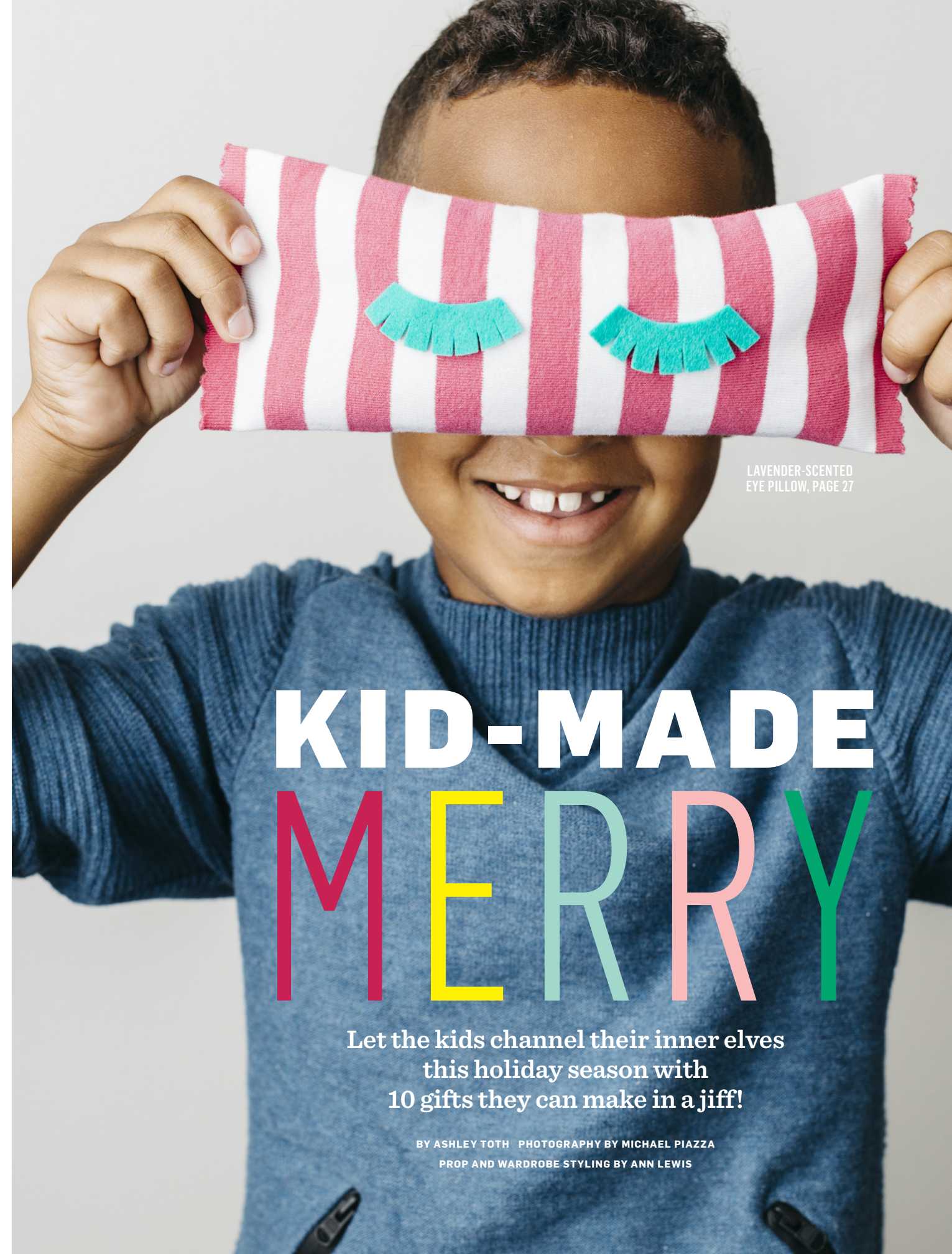
LAVENDER-SCENTED EYE PILLOW, PAGE 27